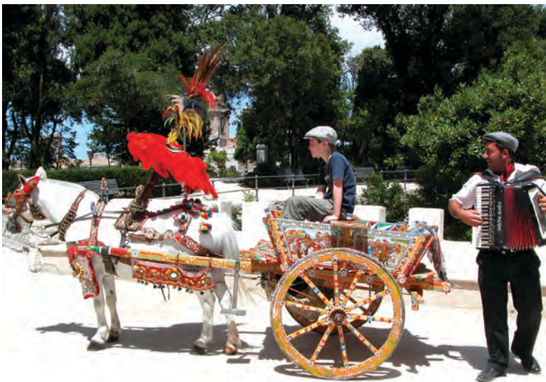
From top: History and great views go hand in hand at Taormina. The valley below Mt Etna. A traditional Sicilian car in Erice

balance adult-oriented activities with kid-focused ones. On this trip I'd followed a two-hour visit to the Uffizi Gallery (my choice) with a gelato stop (his), bartered a three-hour pilgrimage through churches in the medieval town centre of Lucca for an hour's bike ride around the city walls, and traded two hours exploring the Palatine archaeological site in Rome with a session at the city's interactive cinema.